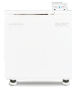
2236R p. 90