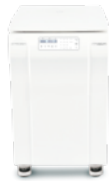
1736R p. 90