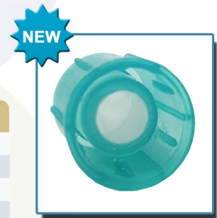
T9005/T9009 35µm Strainer Cap