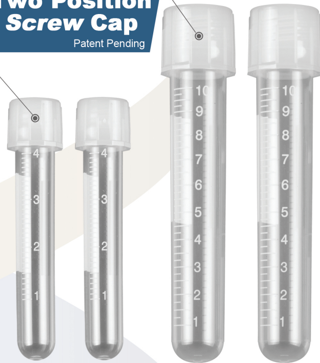
12 x 75mm