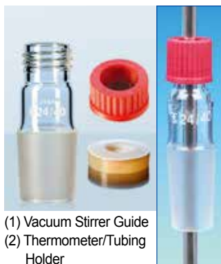
(1) Vacuum Stirrer Guide (2) Thermometer/Tubing Holder

■ Made of DURAN® Borosilicate Glass 3.3 & Seal Kit (GL-Opentop cap / O-Ring Seal : by SciLab Korea).