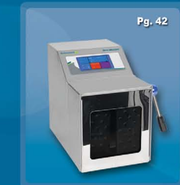
Pulse 150™ Ultrasonic Homogenizer