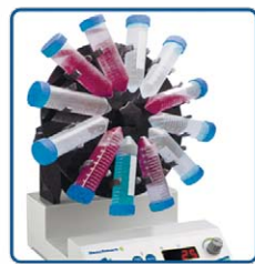
12 x 50ml (12 x 25-35mm Ø tubes)

The Benchmark Rotating Mixer provides gentle to vigorous mixing of laboratory samples up to 50ml. With adjustable speed control and tilt angle, the Rotating Mixer is ideal for a variety of applications, from mixing blood samples to the preparation of homogenous dispersions.