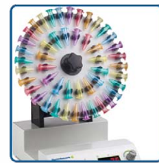
48 x 1.5/2.0ml (48 x 10-14mm Ø tubes)