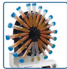
20 x 15ml (20 x 15-20mm Ø tubes)