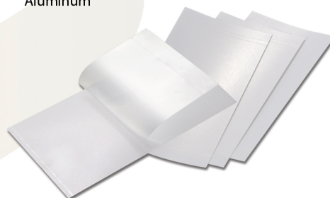
P1001-QPS qPCR, (Pressure-Sensitive Adhesive)