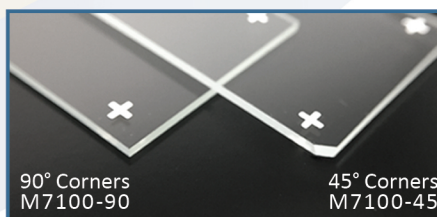
90° Corners M7100-90