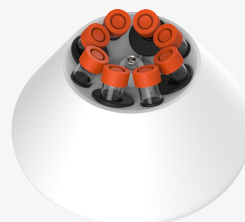
8 x 15ml | 1985 g