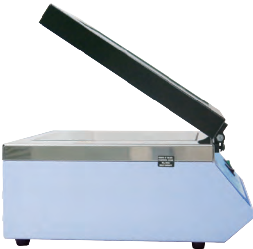
Adjustable UV protection cover