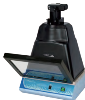
MUV series + MUV-IMG-CM