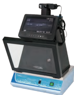
MUV series + DI-01