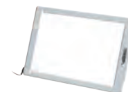
DI-WLA3 (297x400mm) DI-WLA4 (210x297mm) DI-WLA6 (105x150mm)