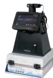
DI-01 + MUVB series