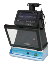
DI-01 + MUV series

*All filters have to be ordered separately and discuss with local dealer before order.