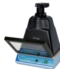
MUV-IMG-CM + MUV series