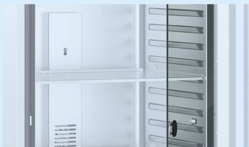
CO 2 Incubator with heated inner glass door

Active humidity control ensures short recovery times after the door has been opened and minimises vaporisation in the interior. Together with the heating of the interior from all six sides and the heated inner glass door, it offers maximum protection for cell and tissue cultures and avoids the dangerous formation of condensation. The turbulence-free chamber ventilation ensures a constant and uniform atmosphere.