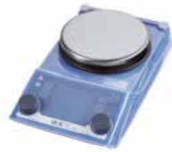
Cover RET control-visc