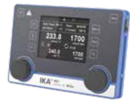
WiCo RET control-visc