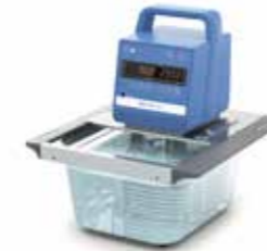
ICC basic eco 8