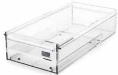
IB R RO 15 eco