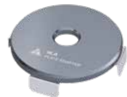
IKA Plate Adapter