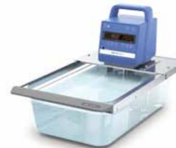
ICC basic eco 18