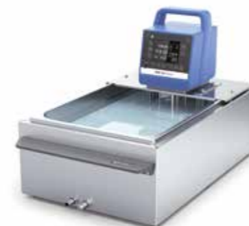
ICC control pro 20