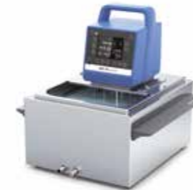
ICC control pro 9