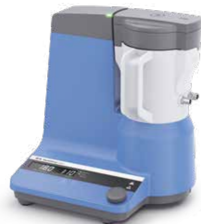
MultiDrive basic M 20 Successor Package