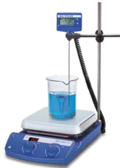
C-MAG HS 7 Package