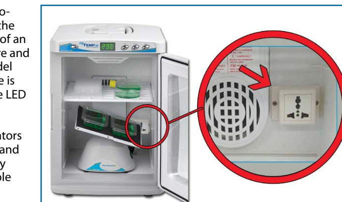
myTemp Mini shown with H3D1020 (Rocker plugs directly into the internal power outlet)