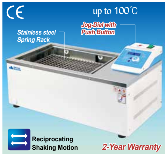
Digital Precise Shaking Water Bath “MaXturdy™ 30”

DAIHAN-brand® Digital Precise Shaking Water Bath “MaXturdy™”, Reciprocating Motion, 18-/30-/45-Lit with Universal Spring Rack, Digital Fuzzy Control, up to 2 Lit. Flask, 20~250 rpm, up to 100℃, ±0.1℃, with Certi. & Traceability 정밀 진탕 항온수조, 왕복 진탕 운동, 디지털 피드백 제어, 고성능 셰이킹 엔진 탑재