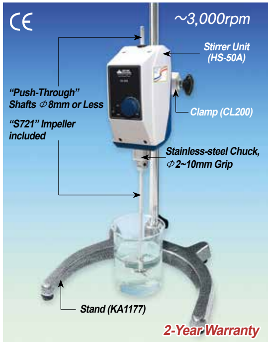
Max. 10 Lit. (H 2 O) Hi-Speed Analog Overhead Stirrer “HS-50A -Set”

DAIHAN-brand® High-Speed Analog Overhead Stirrers “HS-A”, for Low-/Middle-Viscosity, Max.10/20Lit, Max. 3,000rpm with “Push-Through” Shaft(φ 8mm or Less) and Chuck grip φ 3~10mm, Flex-Coupling φ 6~12mm, up to 50,000 mPas 아날로그 고속 교반기, 저/중점도용, 사용교반봉 ; ①기본은 φ 3~10mm, ②관통은 φ 3~8mm, & ③별도의 Flex-Coupling 활용시 φ 6~12mm