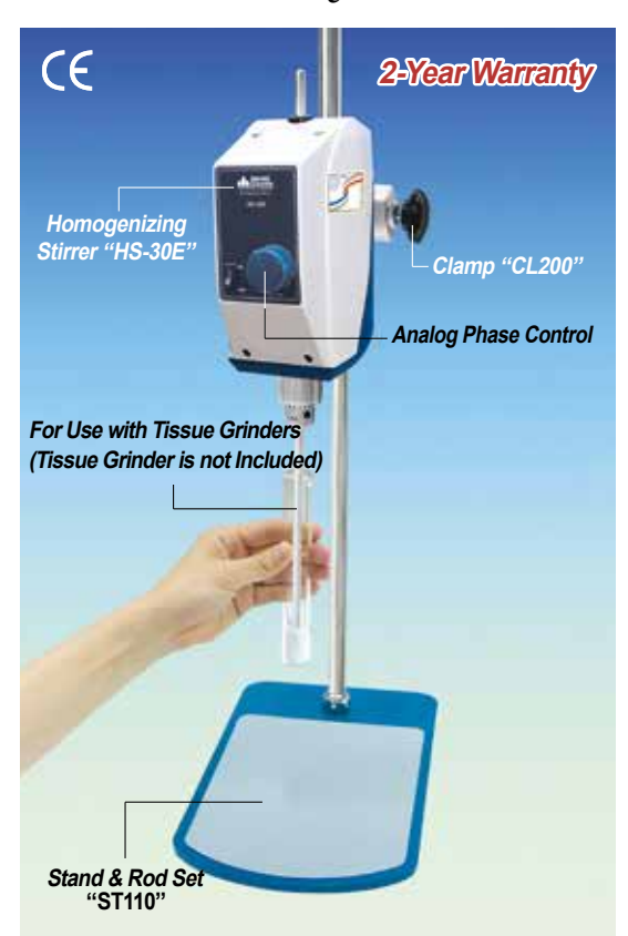
Homogenizing Stirrer Package-Set "HS-30E"

DAIHAN-brand® Homogenizing Stirrer "HS-30E", for Tissue Grinder, 200~5,000rpm for Tissue Grinders, Analog Phase Control, without Tissue Grinder, with Certi. & Traceability, 호모게나이저 스턴리