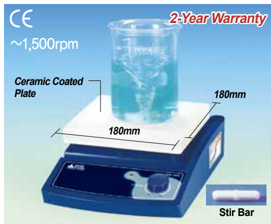
(2) Analog Magnetic Stirrer with Stir Bar “MS-20A”