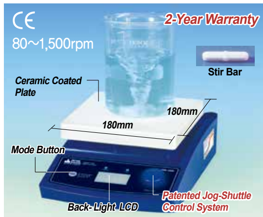
(1) Digital Magnetic Stirrer with Stir Bar “MS-20D”