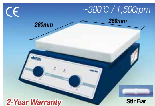
(b) 260×260mm Plate-type Hotplate Stirrer “MSH-30A”