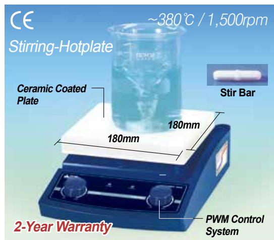
(a) 180×180mm Plate-type Hotplate Stirrer “MSH-20A”

DAIHAN-brand® 380°C Analog Premium Hotplate Stirrer “MSH-A”, Ceramic-Coated Plate, 1,500 rpm, with Certi. & Traceability Built-in Linearity PWM Controller, Superior Temperature Uniformity, Precise Control of Temp. & RPM, 180×180mm or 260×260mm 아날로그 가열 자력 교반기, 우수한 온도균일성, 세라믹 코팅 플레이트