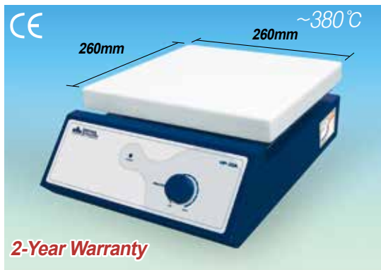
(b) 260×260mm Plate-type Hotplate “HP-30A”