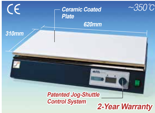
(1) Large Digital Hotplate, with Built-in Digital PID Controller, Ceramic-Coated Plate-type “HPLP-C-P”

DAIHAN-brand® 350°C Large Plate Digital Hotplate “HPLP”, Ceramic-Coated Plate, Superior Temp. Uniformity Built-in Digital PID Controller or Digital Remote Controller, Ceramic-Coated Plate, Back Light LCD, 310×620mm Plate 디지털 대형 정밀 가열판, 디지털 피드백 온도 제어, 디지털 PID 조절기 / 디지털 원격 조절기, 백색 세라믹 코팅판