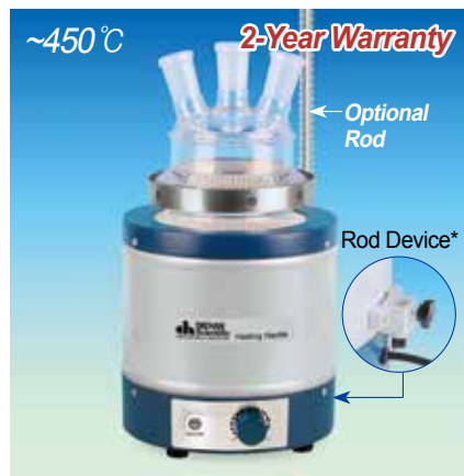
(1) Basic-type Reaction Vessel Mantle with Temp. Controller