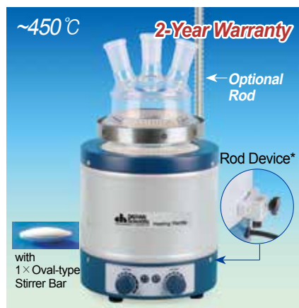
(2) Stirring-type Reaction Vessel Mantle with Temp.-Stirring-Controller and 1 × Mag Stir bar