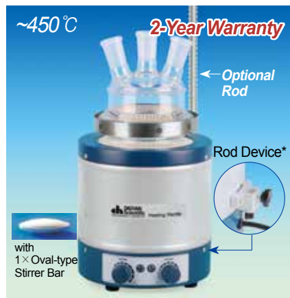
(2) Stirring-type Reaction Vessel Mantle with Temp.-Stirring-Controller and 1 × Mag Stir bar