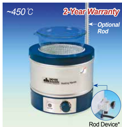
(1) Basic-type Beaker Mantle with Controller