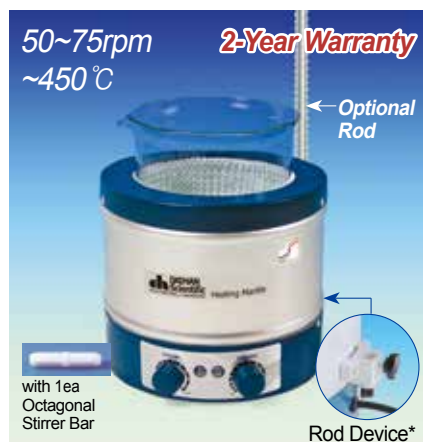
(2) Stirring-type Beaker Mantle with a Stir-Bar