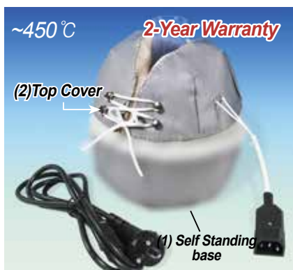
(2) Top Cover only