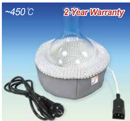
(1) Self Standing-base Mantle