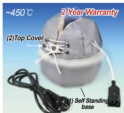
(2) Top Cover only