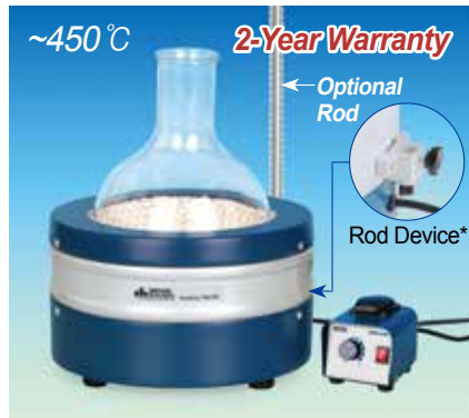
(1) 450°C Basic-type