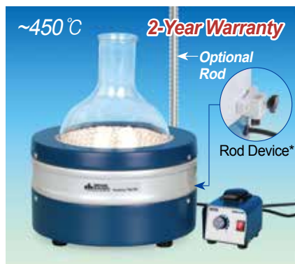
(1) 450°C Basic-type