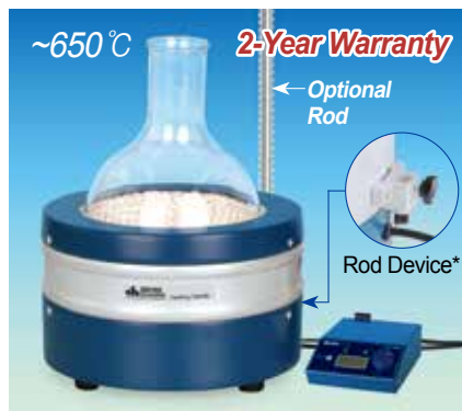
(2) 650°C High Temp.-type