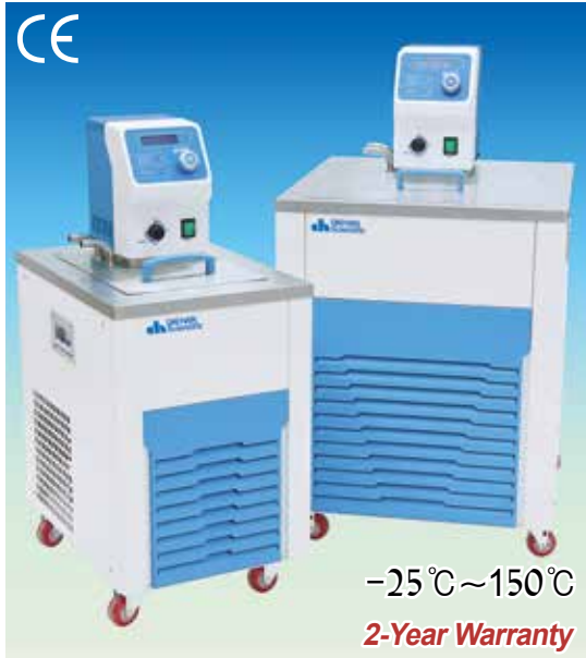
-25℃ ~ 150℃ 2-Year Warranty

DAIHAN-brand® -25℃ ~ +150℃ Digital Precise Refrigerated/Heating Bath Circulator “MaXircu™ CR”, ±0.2℃ with 1× Flat Lid/Digital Fuzzy Control/CFC-free Refrigeration/Certi. & Traceability, Flow 25Lit./min, Lift 4m, 8-/12-/22-/30- Lit. Ideal for Evaporators, etc., with External/Internal Circulating Connect - od.12/id.10mm, 정밀 냉동/가열 배스 겸용 써클레이터