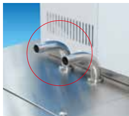
External Circulation Nozzle