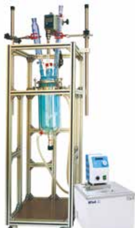
Ex. Multi-use High Temp. Bath Circulator with Modular Reactor System