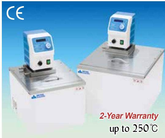
High Temp. Bath Circulators : “CH-8” & “CH-12”

DAIHAN-brand® Precise High-temp Bath Circulator “MaXircu™ CH”, to 250°C, ±0.1°C, 8-/12-/22-/30- Lit with 1×Stainless-steel Flat Lid/Digital Fuzzy Control System/Certi. & Traceability, Flow 16 Lit./min, Lift 2.8m Ideal for Reactors, etc., External Circulating Connect - od.12.5/id.10.5mm, 정밀 고온 배스겸용 고온 써클레이터