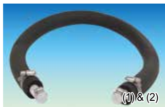
(1) & (2)