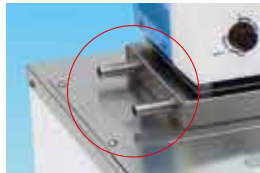
External Circulating Nozzle

* Other Specifications are available upon Customer's Request. ※ 운임 약 ₩ 9,000 별도