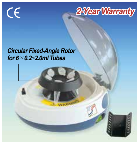
Mini-microcentrifuge Set “CF-5” with Circular Fixed Angle Rotor

DAIHAN-brand® High performance Mini-microcentrifuge Set “CF-5”, Max. 5,500 rpm, with Certi. & Traceability with Circular Fixed-Angle Rotor for 6×0.2/0.5/1.5/2.0ml Tubes and Strip Rotor for 2×0.2ml PCR 8-tubes Strips/16×0.2ml PCR Tubes 미니-마이크로 원심분리기 세트, 앵글-/스트립-로터 포함, 0.2/0.5ml 튜브 어댑터 포함