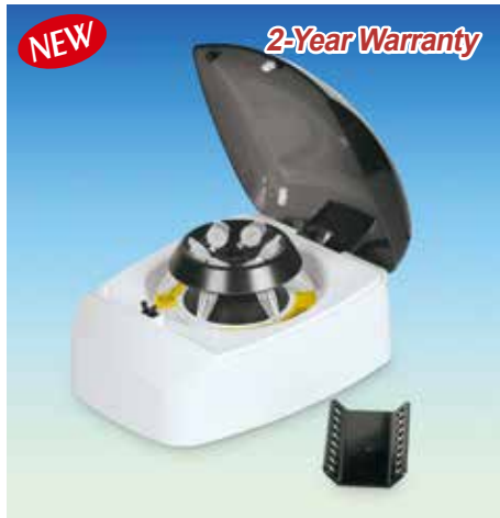
Mini-microcentrifuge Set “MaXpin C-6mt” with Circular Fixed Angle Rotor

DAIHAN-brand® New-generation Mini-microcentrifuge Set “MaXpin C-6mt”, Max. 5,500 rpm, Rapidly Stop Spin-motion for safety with Circular Fixed-Angle Rotor for 6×0.2/0.5/1.5/2.0ml Tubes and Strip Rotor for 2×0.2ml PCR 8-tubes Strips/16×0.2ml PCR Tubes 미니-마이크로 원심분리기 세트, 신속한 회전동작 정지, 앵글-/스트립-로터 포함, 0.2/0.5ml 튜브 어댑터 포함 NEW