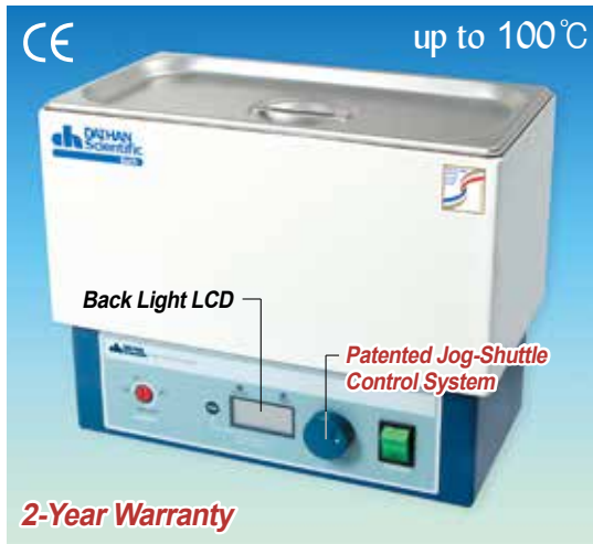
Digital Precise Water Bath, 11Lit. “WB-11”

DAIHAN-brand® Digital General Purpose Water Bath “WB”, 6-/11-/22- Lit, up to 100°C, ±0.1°C, CE-Certi. with Digital Fuzzy Control System, 1×Stainless-steel Flat Lid, and Back Light LCD, with Certi. & Traceability 정밀 범용 항온수조, 디지털 퍼지 제어 시스템, 스텐레스 스틸 리드 포함