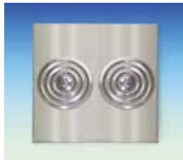
(4) “BFC111” Lid with Concentric Ring Cover Sets for 11Lit.