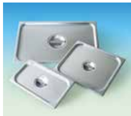
(1) Flat Lid, Stainless-steel (Included)

* Other Specifications are available upon Customer's Request.