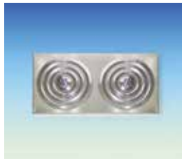
(3) “BFC106” Lid with Concentric Ring Cover Sets for 6Lit.