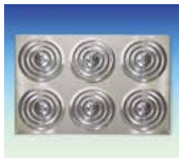
(5) “BFC122” Lid with Concentric Ring Cover Sets for 22Lit. Bath