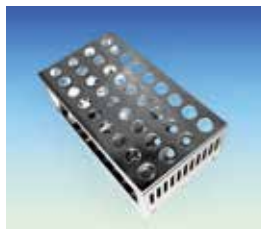
(6) Test Tube Rack, Stainless-steel