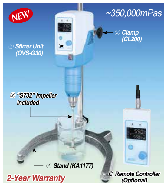
B. Max. 100Lit (H 2 O) PREMIUM Ultra “OVS-G30” Package-set