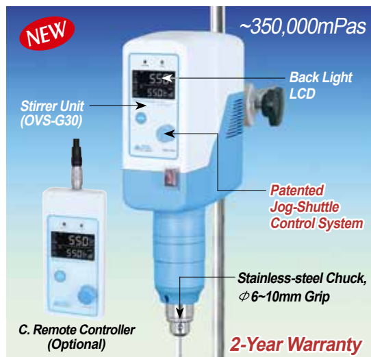
A. Max. 100Lit (H 2 O) PREMIUM Ultra “OVS-G30” Unit Only

DAIHAN® PREMIUM Ultra Hi-Torque Overhead Stirrer “OVS-G30”, with Hi-Capacity BLDC-motor, Max. 60:1 NEW With Planetary-gear, Torque(Ncm)- / Viscosity(mPas)- / Temperature(°C)-Real Time Display, Optional Remote Control 프리미엄 초고점도용 교반기, 고사양 BLDC-motor, 토크- / 점도- / 온도-표시기능, Max. 550rpm, 350,000mPas