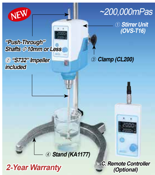
B. Max. 100Lit (H 2 O) PREMIUM "OVS-T16" Package-set