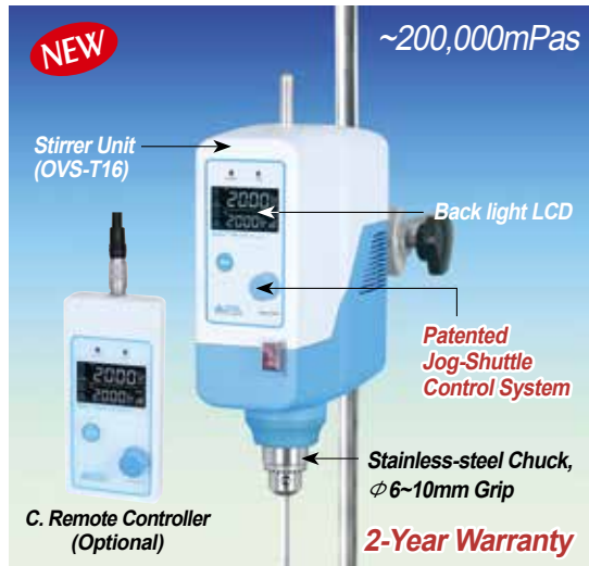
A. Max. 100Lit (H 2 O) PREMIUM "OVS-T16" Unit Only

DAIHAN® PREMIUM Hi-Torque Overhead Stirrer "OVS-T16", with Hi-Capacity BLDC-motor, Max. 14:1, 200,000mPas With Torque(Ncm)- / Viscosity(mPas)- / Temperature(°C)-Real Time Display, Optional Remote Control, Max. 2,000rpm NEW 프리미엄 중/고점도용 교반기, 고사양 BLDC-motor, 토크- / 점도- / 온도-표시기능, "Push-Through" Shaft(φ 10mm or Less)