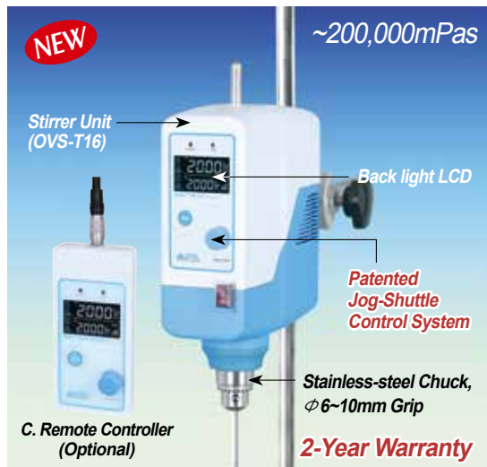
A. Max. 100Lit (H 2 O) PREMIUM "OVS-T16" Unit Only

DAIHAN® PREMIUM Hi-Torque Overhead Stirrer "OVS-T16", with Hi-Capacity BLDC-motor, Max. 14:1, 200,000mPas With Torque(Ncm)- / Viscosity(mPas)- / Temperature(°C)-Real Time Display, Optional Remote Control, Max. 2,000rpm NEW 프리미엄 중/고점도용 교반기, 고사양 BLDC-motor, 토크- / 점도- / 온도-표시기능, "Push-Through" Shaft(φ 10mm or Less)