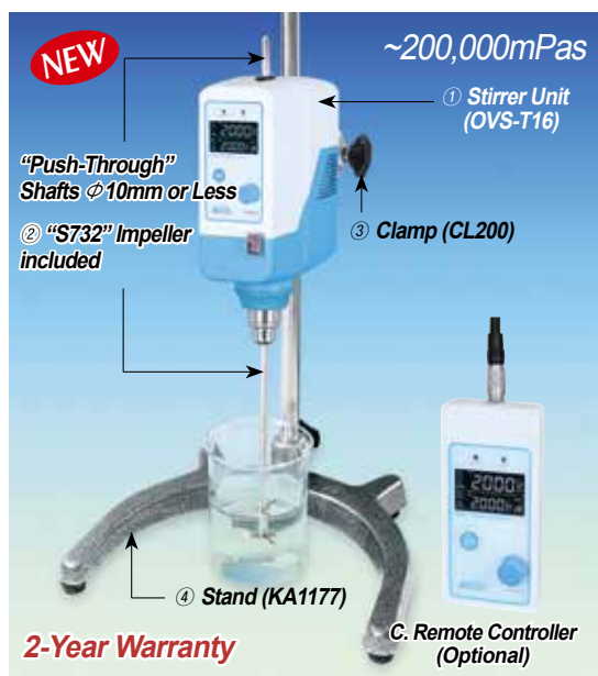
B. Max. 100Lit (H 2 O) PREMIUM "OVS-T16" Package-set