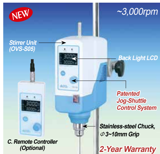
A. Max. 100Lit (H 2 O) PREMIUM “OVS-S05” Unit Only

DAIHAN® PREMIUM Hi-Speed Overhead Stirrer “OVS-S05”, with Hi-Capacity BLDC-motor, 2:1, Max. 3,000rpm NEW With Torque(Ncm)- / Viscosity(mPas)- / Temperature(°C)-Real Time Display, Optional Remote Control, 50,000mPas, Max. 100Lit 프리미엄 고속 교반기, 저/중점도용, 고사양 BLDC-motor, 토크- / 점도- / 온도-표시기능, “Push-Through” Shaft(φ 10mm or Less)