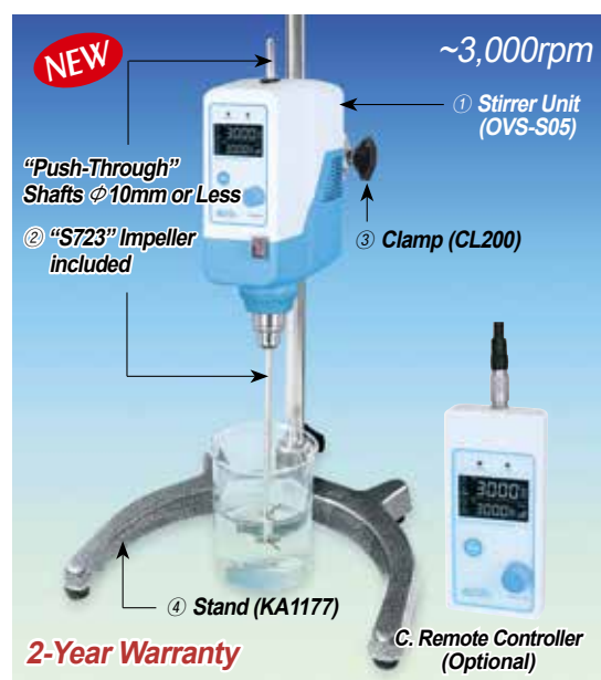
B. Max. 100Lit (H 2 O) PREMIUM “OVS-S05” Package-set