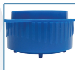
Four 2mm tall feet For use with plates and dishes