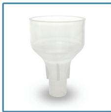
Reducing adapter for 5 & 15mL tubes