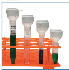
Reducing adapter equipped on 15 & 5mL tubes