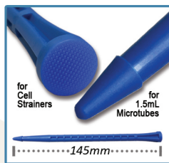
PolyPestle™ Dual sided Pestle for strainers & microtubes