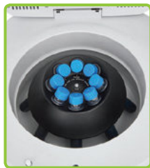
15ml Conical Centrifuge Tubes