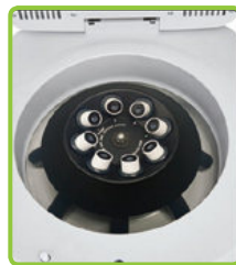
10ml Blood Collection Tubes