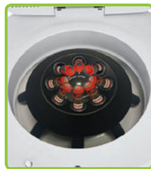
15ml Blood Collection Tubes