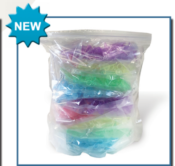
C2000-50AST Single Color Bags of 50