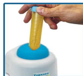
Insta-Touch™ pressure activation