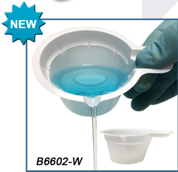
WeighBucket™ - Weigh Boat for Liquids!

MTC Bio's Weigh Boats are useful for liquid, powder or granular samples. They are made of antistatic polystyrene and will withstand temperatures to 90°C, as well as exposure to diluted acids, alcohols, bases and aqueous solutions. Weigh Boats are available in the traditional square shape as well as in a new diamond shape for easier pouring and more stable transfer of liquids.