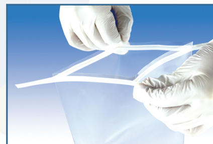
Pull tabs on both sides of bag for easy opening

SureSeal™ Bags are gamma sterilized, leaving a virgin interior surface with no toxic residue from gas exposure. Samples are easily collected by removing the tear strip above the wire closure and pulling on the two external grip tabs to open the mouth of the bag to the desired level. Using the grip tabs ensures sterility and eliminates the risk of contamination from finger contact. SureSeal™ Bags meet USDA, EPA and FDA standards and are sterile, RNase-free, DNase-free and non-pyrogenic.