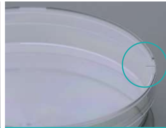
Vent points for Gas Exchange