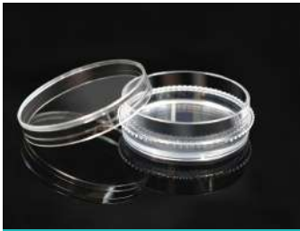
35 mm Dishes with Griping Ring