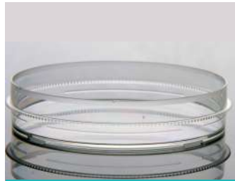
100 mm Dishes with Griping Ring