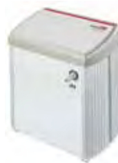
Models MPC 095 Z / MPC 110 E MPC 105 T