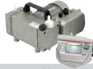
Models MPC 301 Z ef