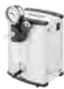
Model MPC 090 E