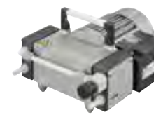
Model MPC 101 Z

CE All product listings on this page CE listed.