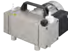
Models MPC 301 Z / MPC 302 Z MPC 601 E