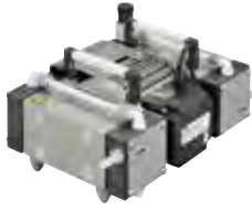
Model MPC 201 T