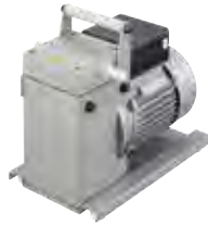
Model MPC 301 E