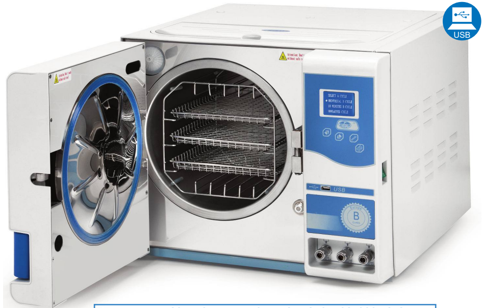
TEMPERATURE CONTROL AND AUTOMATIC MICROPROCESSOR CYCLE.