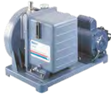
Model DuoSeal 1400/1402/1405

Specifications & Ordering - p. 48, 52, 54