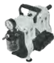
Models 2585 / 2581