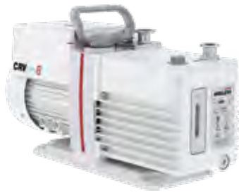
Model CRVpro 4/6/8