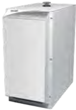
Model 2070/2071 Chemstar Dry