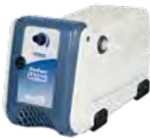
Models 2032 / 2042 DRYFAST Ultra