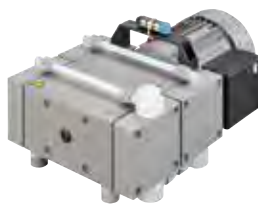
Models 2052 / 2054